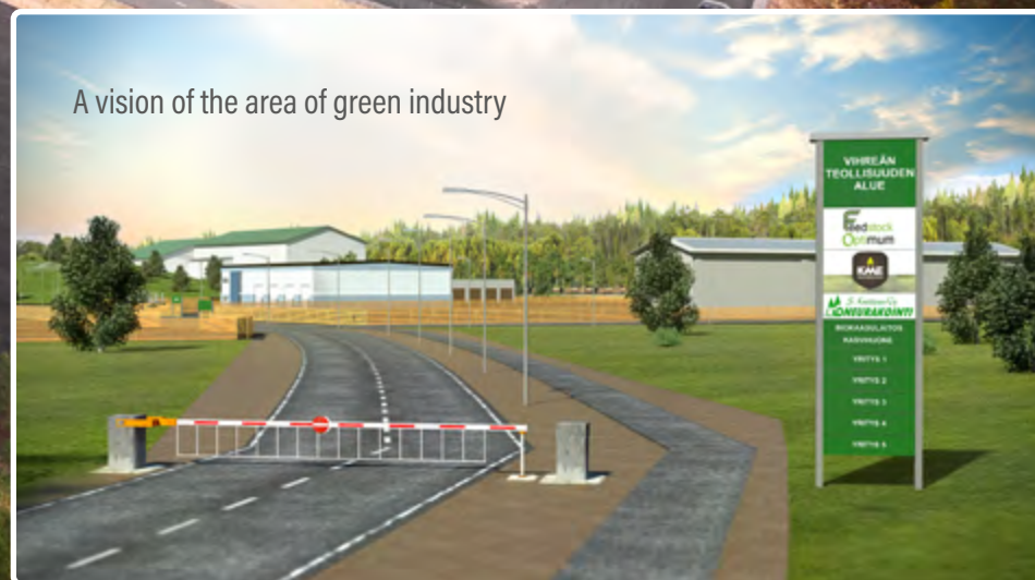
A vision of the area of green industry

Download cards: www.pohjois-karjala.fi/bioteollisuusalueet